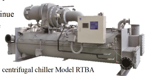
Low GWP high-efficiency centrifugal chiller Model RTBA

EBARA REFRIGERATION EQUIPMENT & SYSTEMS and AGC will continue applying their respective technologies and products, making valuable contributions to our customers’ efforts to suppress global warming in the refrigeration, cooling, and air conditioning fields.