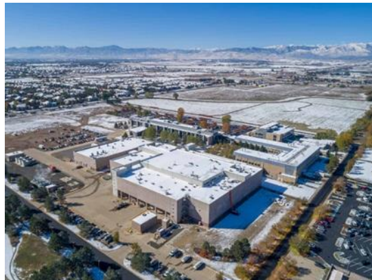
The facility to be purchased

The addition of this facility follows last year's acquisition of the Italian company MolMed (now AGC Biologics S.p.A., referred to as "Milan Site") , which is currently undergoing expansion previously announced . With the needs of customers rapidly increasing in the fast-growing field of gene and cell therapy, AGC Biologics is securing further manufacturing capacity, this time in the United States, the world-leading market in this field. Once the transaction closes, the facility will be integrated into AGC Biologics' network, and services will be extended incorporating the Milan Site's robust experience providing commercial GMP* 2 -compliant cell and gene therapy CDMO services, utilizing the facility's large floor space at over 60,000 square meters. Further, the Heidelberg Site has an established plasmid DNA production service, enabling AGC Biologics to offer end-to-end cell and gene services. This facility will become part of that offering.