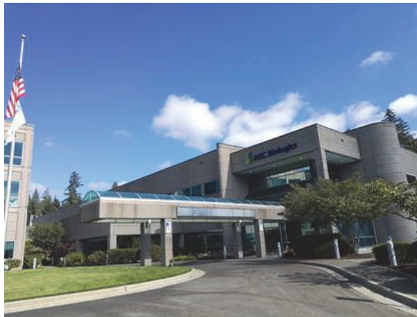
AGC Biologics, Seattle site

At AGC Biologics' Seattle site, plans have been finalized to install twelve additional 2,000L single-use* 2 mammalian cell bioreactors, and to establish a brand new microbial contract development and manufacturing facility. AGC Biologics' current microbial capacities are in Europe and Japan, and the addition of the Seattle facility will provide wider regional coverage across the continents for microbial services as well. Once operational, AGC's biopharmaceutical production capacity in the US will be tripled. The total investment for this expansion is estimated to be about 10 billion yen, with full-scale operations slated to start from July 2020.